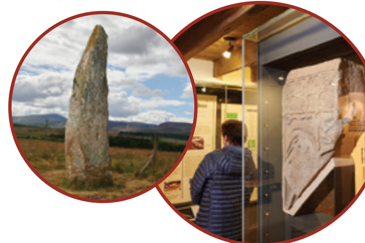
Photo credits: Thanks to Ewen Weatherspoon, DUFI Art, Inverness Museum and Art Gallery. Urquhart Castle © Historic Environment Scotland; Nigg Stone and Knocknagael Boar Stone – both © Crown Copyright HES